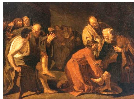
Christ Washing the Feet of His Disciples by Dirck van Baburen (circa 1594)

“But the fruit of the Spirit is love, joy, peace, patience, kindness, goodness, faithfulness, gentleness, self-control; against such things there is no law. (Gal. 5:22-23)