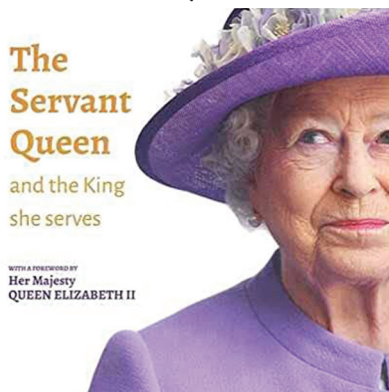
From cover of a book published in 2016

As I learned of Queen Elizabeth’s death at the age of 96, then watched on TV and computer screen as her British subjects grieved and prepared for and so perfectly carried out her funeral and burial services, I was certainly struck by her life of service and dedication to duty.