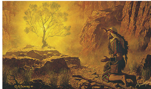
Moses and the Burning Bush by Arnold Friberg, 1999

So what does “ fear the Lord ” mean in our text? All of these!