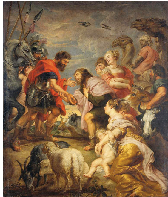
Reconciliation of Jacob and Esau by Peter Paul Rubens (1624-1628)