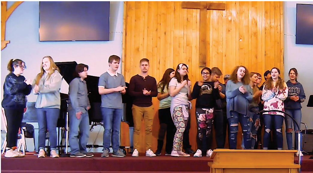
Decipleship Training Intensive (D.T.I.) group helps lead in worship at GFC on 2/20/22