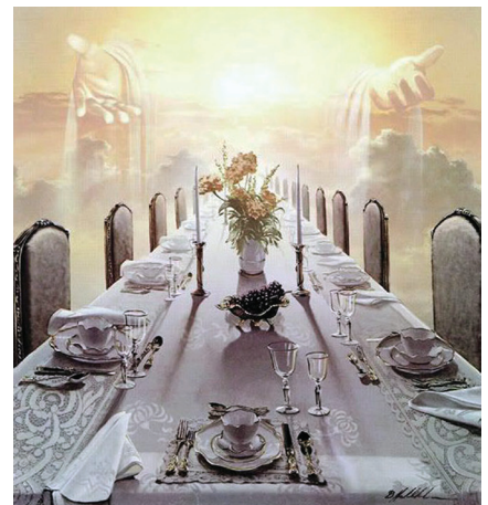
The Marriage Feast of the Lamb (by Danny Hahlbohm, 2012)

What kind of image comes to mind when you think of the Marriage Supper of the Lamb? I have always thought of it as a banquet, not exactly formal but nice. A long table (very long, in this case) with linen tablecloth and napkins, elegant china place settings, more silverware than I know what to do with, and an abundance of delicious and artfully served food. Everyone is happy and well-mannered. There is plenty of conversation, but it is not noisy by any means.