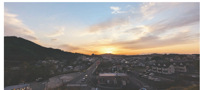
Sunset in Funehiki Town 船引町の夕日