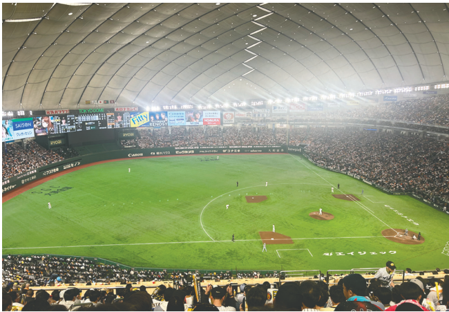
Tokyo Dome Baseball (Tokyo Giants v. Osaka Tigers) 東京ドーム野球(東京ジャイアンツ対大阪タイガース)

Our spring break has passed, and with that, a new school year has begun. I was able to travel to Tokyo for my spring break. I had a lot of fun going to coffee shops, walking through some ancient gardens, and going to a baseball game at Tokyo Dome. Traveling was fun to explore around a new area, and it was a good change of pace from my day-to-day routine.