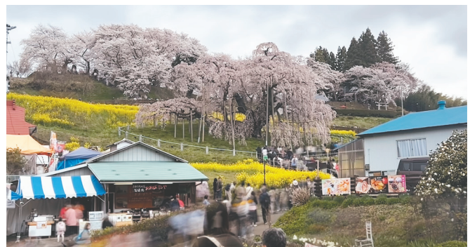
The Waterfall cherry tree of Miharuru 滝桜 美晴