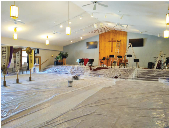
Phase 1 – underway the week of June 14th