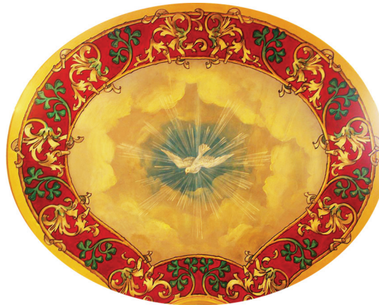
The Holy Spirit as a Dove. From a painting on the canopy over the ambo (lectern) in the historic Church of St. Patrick, in Toledo, Ohio. Artist and date unknown.

Just as “servant” generally means “one who serves, a slave” but can be used more specifically to refer to the office of deacon in the church, so also we see “gifts” used. In the general sense, God gives us all things. He gives us life. He gives people different kinds and color of hair. He gives different folks differing natural abilities. Some have a natural gift of music where it comes easily and with