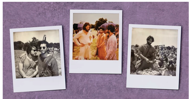
on The Chosen set