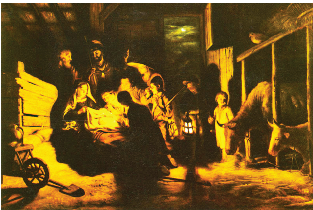
The Adoration of the Shepherds (1658) oil painting on wooden panel - in the Musée des Beaux-Arts de Montréal (Museum of Fine Arts), Montreal, Quebec, Canada by Nicolaes Maes (1634-1693) a Dutch Baroque painter and student of Rembrandt whose influence can clearly be seen in this painting.

Thanks be to God that we don't have to pretend we have a nice clean inn of a life. He will make sure that our valleys are made high and our mountains are laid low, to prepare a way for the Lord. I find great comfort in that. " God and sinners reconciled. "