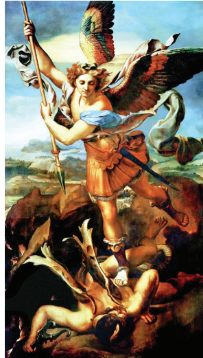
St. Michael Vanquishing Satan (1518) by Raffaello Sanzio Urbino

Their power is spiritual, working in ways that are not subject to the laws of the physical world, or are not experienced by our five senses of sight, sound, touch, taste or smell. But we can be aware of them. As human beings we can have the ability to sense that something is wrong or evil. And these characters are. Some of us are able to sense that more than others.