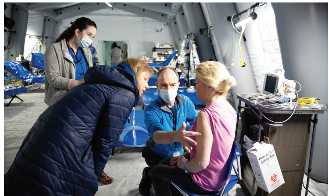
This Samaritan's Purse Emergency Field Hospital is open in western Ukraine, and their medical team is already treating patients suffering due to the escalating conflict there.

The world is shocked and horrified by the images of death and destruction coming out of Ukraine, a catastrophe we have not witnessed in Europe since the Second World War. The United Nations reports that more than 2.5 million refugees, primarily women and children, have already left Ukraine seeking shelter in nearby countries. An additional 2 million are displaced within Ukraine. Please join me in praying for the people of Ukraine and for this conflict to end quickly.