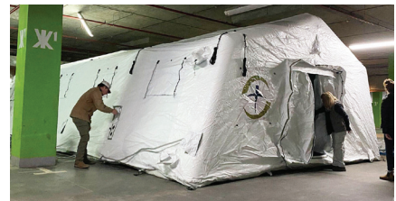
Samaritan's Purse Field hospital being set up in a parking garage in Ukraine

Our nearly 60-bed facility—airlifted via two flights of our DC-8 cargo plane and an additional 747 flight—has an ICU, two operating theaters with capacities for dozens of surgeries each day and an emergency room that can handle 100 patients daily.