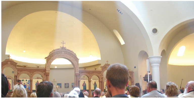
The new church with bare walls in 2012 at Fr. Peter Gillquist's funeral (Photo by John Kurtz showing beams of light coming through the dome on the coffin)