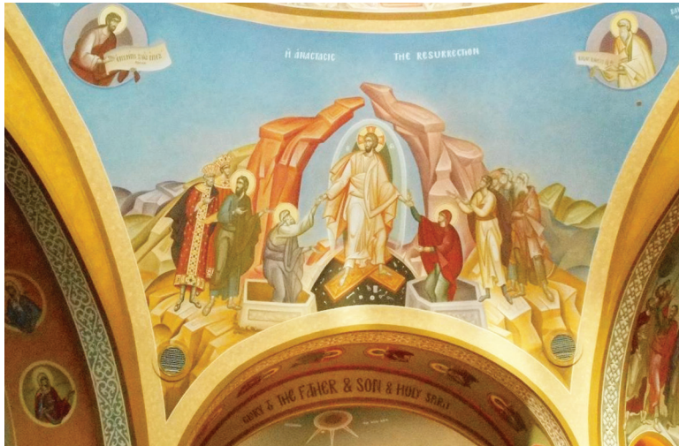
The church today exhibits icons of the Resurrection (to the left below)