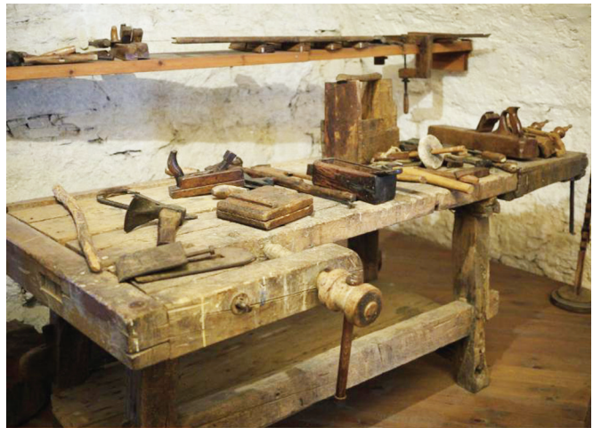
Let the Lord do His workmanship in your life!