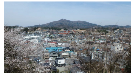
Awaiting each new Sensei: Funehiki and Mt. Katasono with cherry trees in bloom 新しい先生を待っています桜、フネヒキ、そしてカタソン山