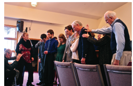
Prayer and blessing for the new teachers during worship at GFC on March 31 新しい先生のための祈りと祝福