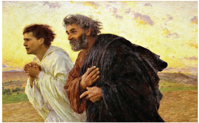
"The Disciples" (running to the empty tomb) by Eugène Burnand (1898)