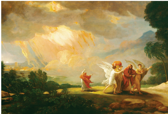
“Lot fleeing from Sodom” (cropped) by Benjamin West (1810)

You will never understand your struggle with sin unless you grasp that, at its very bottom, sin is a heart problem. It is not first a problem of bad behavior although it always goes there. It is not first a location or situation problem although it expresses itself there. Sin is a matter of the heart. Let me explain what this means.