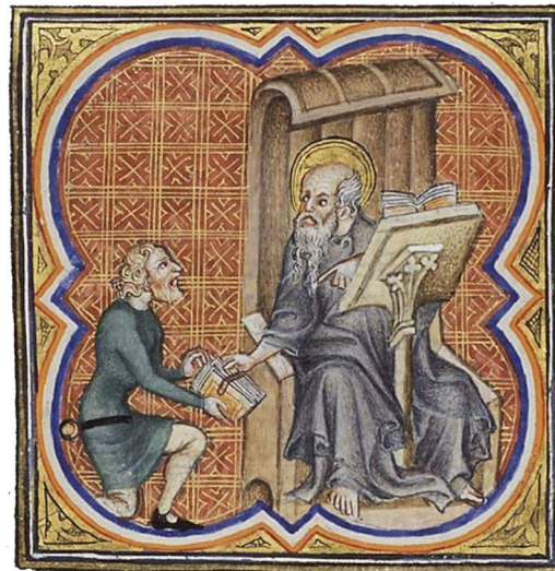
The Apostle Paul sending off a letter — from a 1372 illuminated manuscript in the National Library of the Netherlands.

We can hear Christ agreeing to take our place and to have all our sin imputed to Him. “ For God made Christ, who never sinned, to be the offering for our sin. ” (2 Corinthians 5:21.)